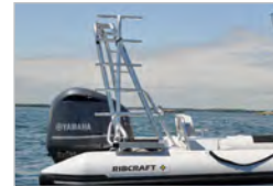
Antenna arch with integrated swim ladder