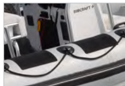
Boarding wear patches