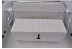
Three person bench seat with integrated cooler

Bow storage box/seat with cushion (6.8 only)