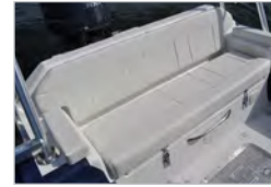
Molded transom bench seat with storage