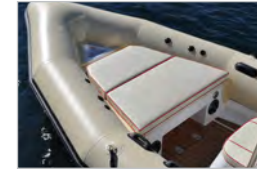
Bow sun platform